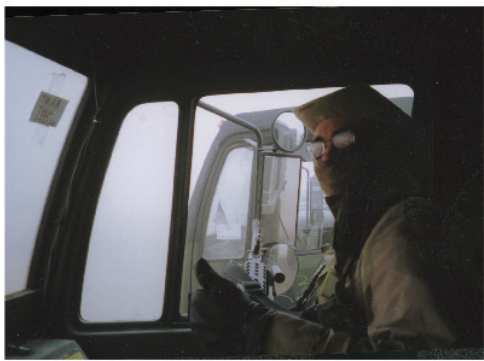
Thumbs up, “I’m ready to roll”

Many civilians “assume” that military members who return from a combat zone have immediate access to medical, mental health and dental treatment.