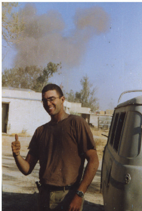
Thumbs up, “I’m okay”

The main thing to remember in order to continue recovery is to keep hope, faith and to NEVER give up no matter how much pain you might be experiencing. Believe me, I have been there, but I held on at all costs and sooner or later, if you don’t find help, then help will find you.